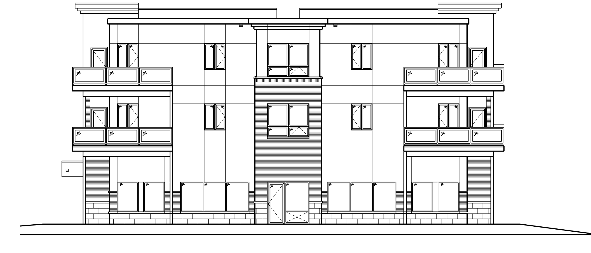
5 EAST ELEVATION SCALE 3/32" = 1'-0"

J.B. BLACK ESTATES KOLISNEK DEVELOPMENTS INC. 1132 COLLEGE DRIVE SASKATOON, SASKATCHEWAN