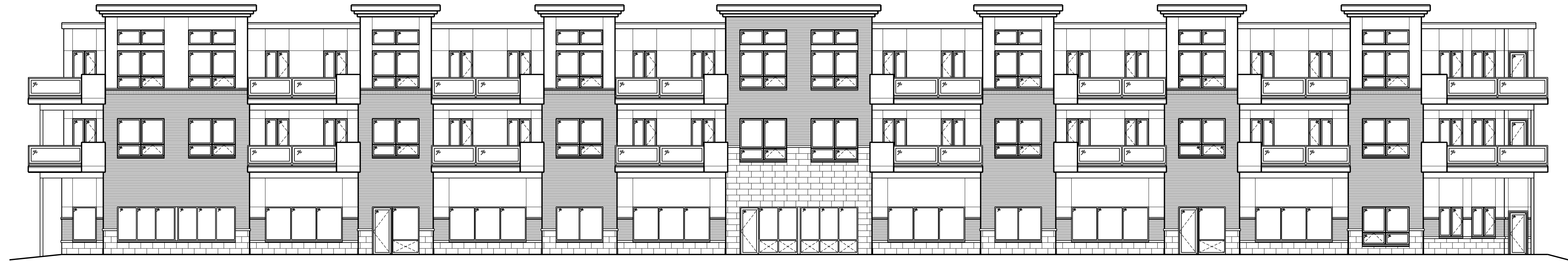
2 NORTH ELEVATION SCALE 3/32" = 1'-0"