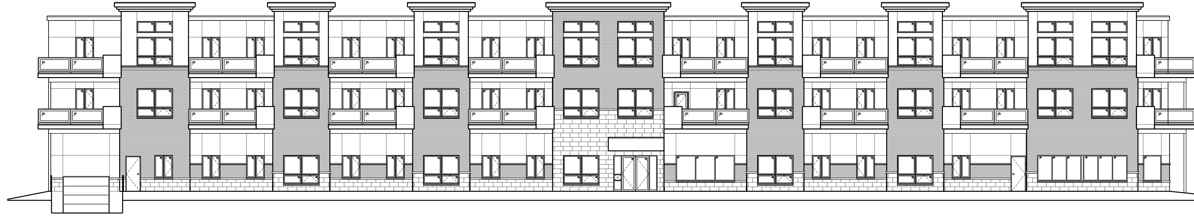
3 SOUTH ELEVATION SCALE 3/32" = 1'-0"